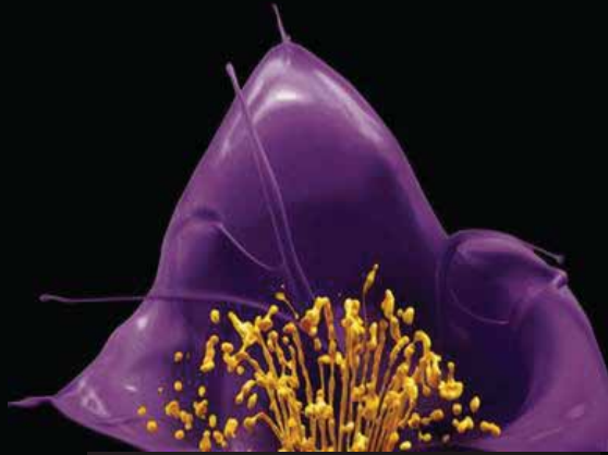
PRINT - SILVER TBWA Santiago Mangada Puno "Violet" Boysen Paint