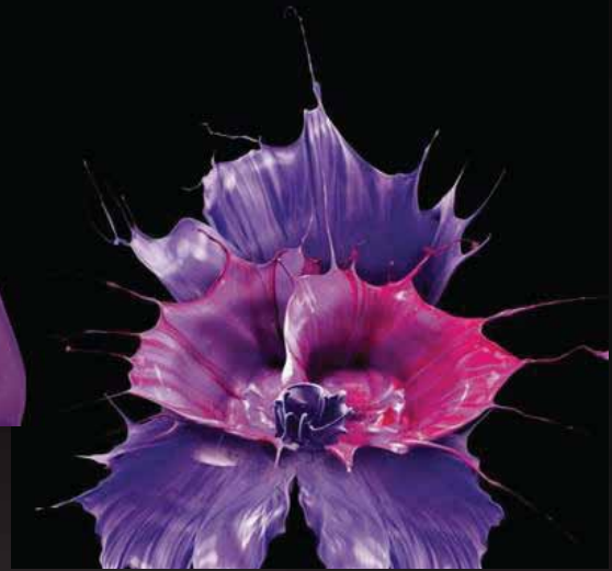
ART & TECHNIQUE - BRONZE TBWA Santiago Mangada Puno "Orchid" Boysen Paint

PHILIPPINES, AUGUST 17, 2010 - Although the Gold World Medal remained elusive, the Philippines had metal to take home: one Silver and three Bronze medals at the New York Festivals International Advertising Awards last June. TBWA Santiago Mangada Puno's Flower Series for Boysen Paint continued its winning streak with a Silver for "Violet" in Print, and Bronzes in Print for "Lily" and in Art & Technique for "Orchid".